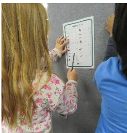
(L) Mini Beast Hunt

Later in the week there was an Ugly Creatures Hunt and a Curious Creatures Quiz , which the Year 3 class did very well in! The Creature in the Box turned out to be a CAT!