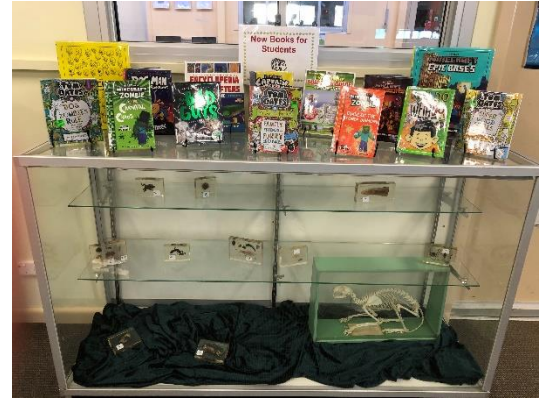
(Above) Curious Creatures

Students also had fun reading and playing in The Magic School Bus . Somehow the Big Bad Wolf and Indiana Jones managed to get on board and enjoy a trip in the Deep Blue Abyss!