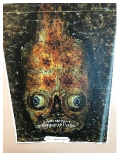
An Ugly Creature - Dactyloscopus foraminosus (Reiculate Stargazer)